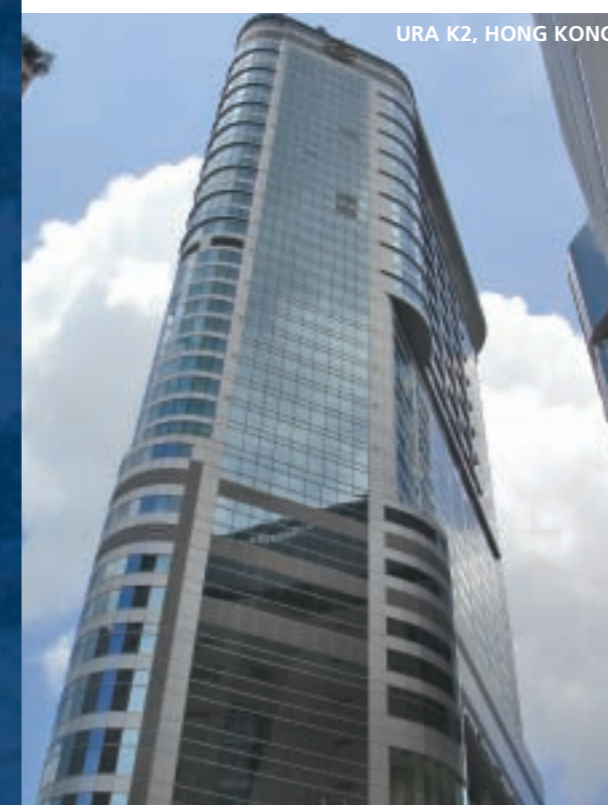
URA K2, HONG KONG