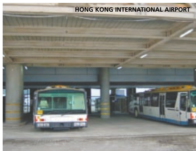
HONG KONG INTERNATIONAL AIRPORT