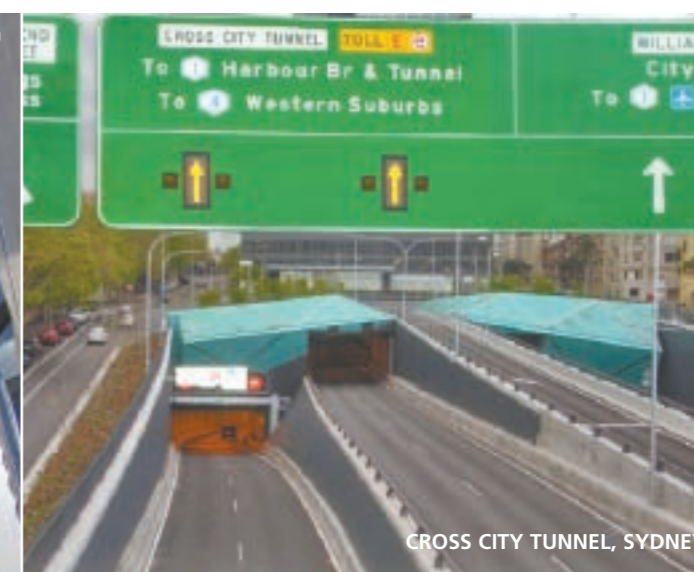
CROSS CITY TUNNEL, SYDNEY