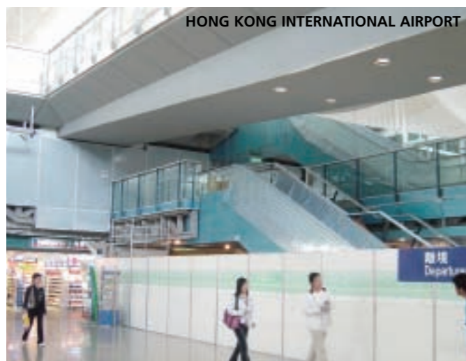
HONG KONG INTERNATIONAL AIRPORT

Project: URA K2 Comprehensive Redevelopment Challenge: Competitive Tender bid with 2 hrs internal and external passive fire protection to structural steel. Result: Vermitex® 'AF' and 'DX' were chosen by Client to provide 2 hour fire protection to approximately 35,000 m² of structural steel area. Completed: 2003