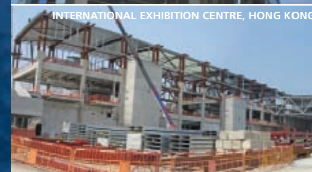
INTERNATIONAL EXHIBITION CENTRE, HONG KONG